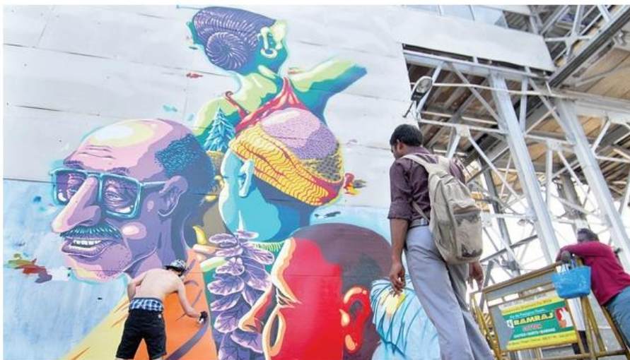
A painter works on a piece of art on a wall of the Egmore Railway Station, as a passerby looks on | R SATISH BABU